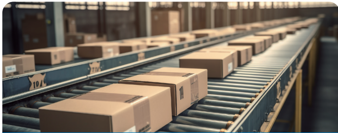
Logistics | Eco-friendly bags/warehousing/points