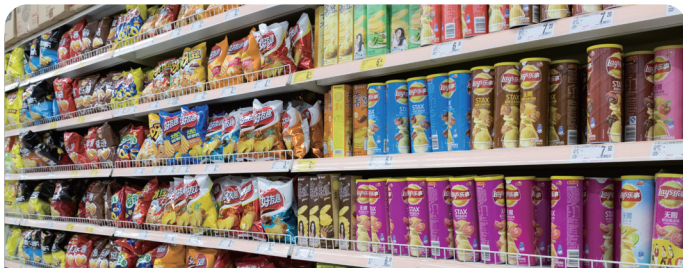
Retail | Retail/Store Management/Warehouse Management