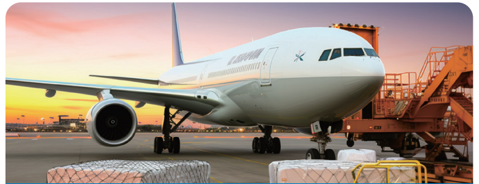
Public Utilities | Aviation/Medical/Finance/Electricity