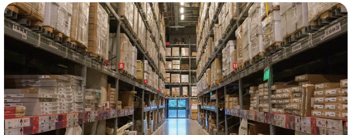
Manufacturing | Assets/Wareshousing/Tools